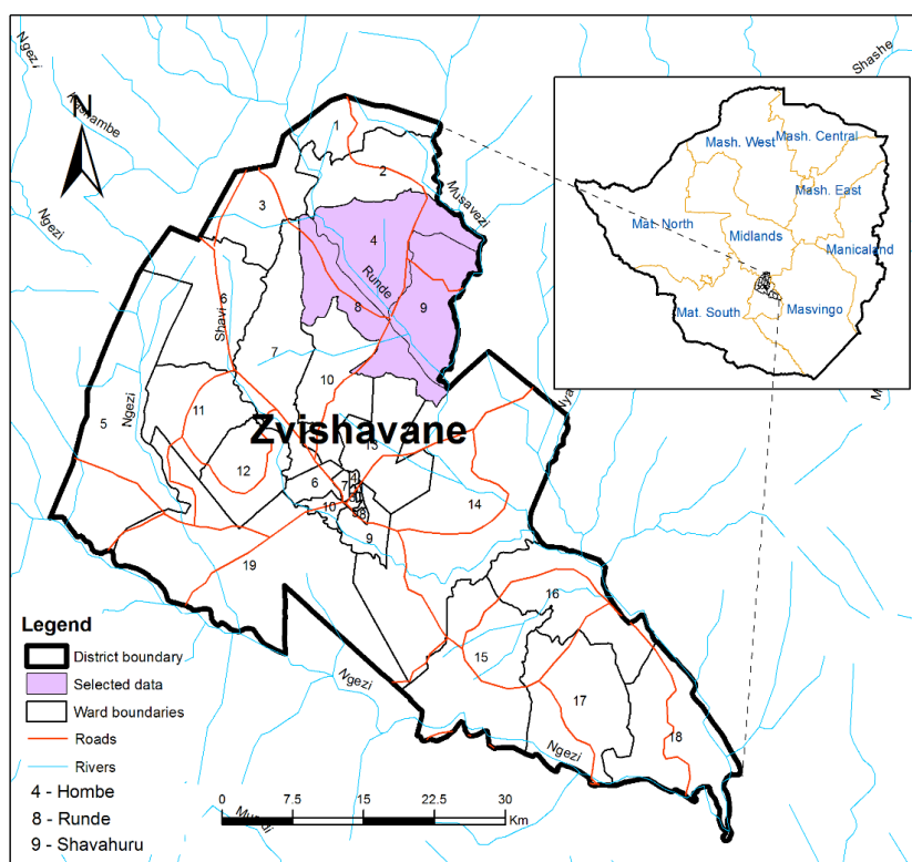
Figure 1 Study Area

Zvishavane lies in the southern part of Midlands province of Zimbabwe, in agro-ecological region IV of the country, which receives annual rainfall of 450-600mm. The region is characterised by seasonal droughts and severe intra season dry spells. Although considered to